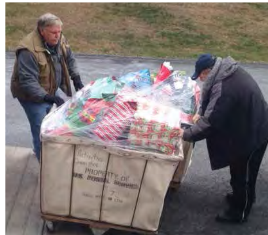
Air Products staff delivers a load of Christmas presents – no reindeer needed!

Every year, Air Products and Chemicals, Inc., of Allentown, Pennsylvania, contacts Diakon Adoption & Foster Care and requests names (first names only) of children in foster care. The company's generous staff members buy gifts for each child, then wrap and deliver the gifts to the Topton location. Diakon Adoption & Foster Care staff make the deliveries to the foster children.