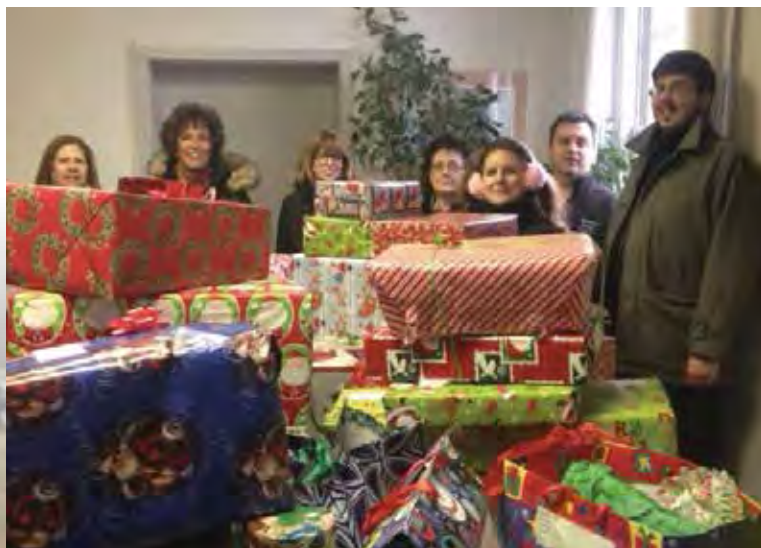
Gifts donated by Air Products staff makes their way to foster children served by Diakon.