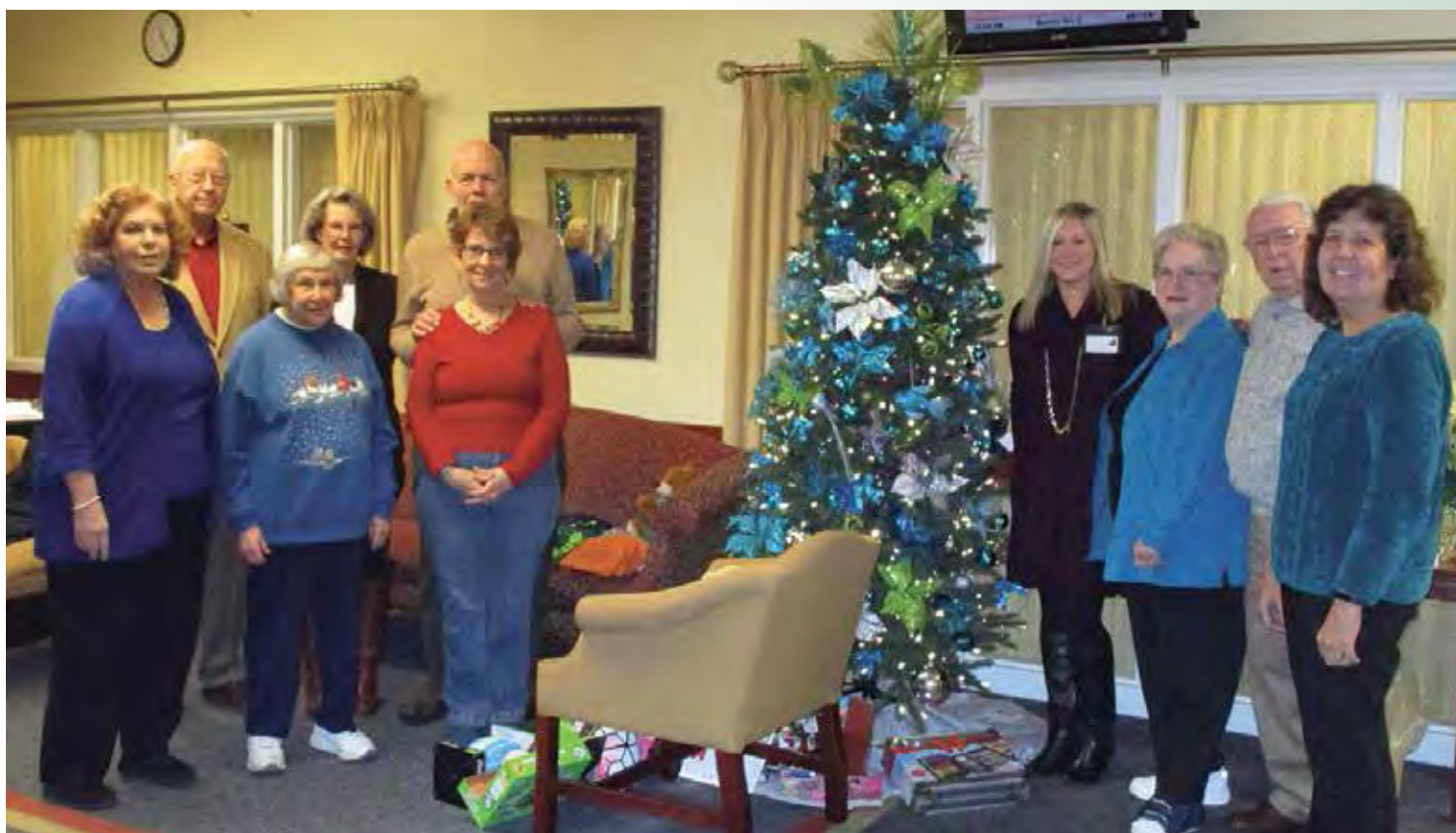
Cumberland Crossings residents put presents under their Christmas tree for Diakon foster youths.