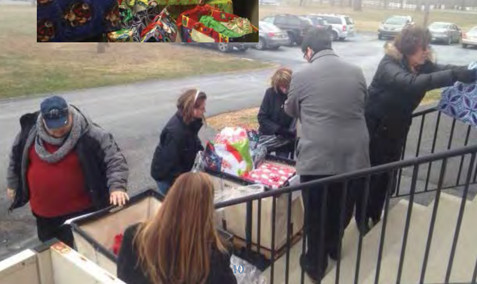
Santa's helpers from Air Products deliver presents for children in foster care.