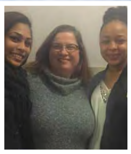
December (left) was adopted Dec. 14, 2016, by Ellen.