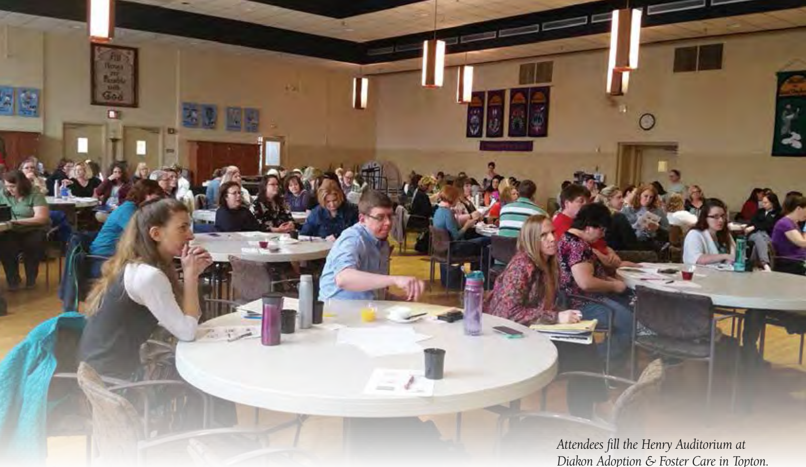
Attendees fill the Henry Auditorium at Diakon Adoption & Foster Care in Topton.